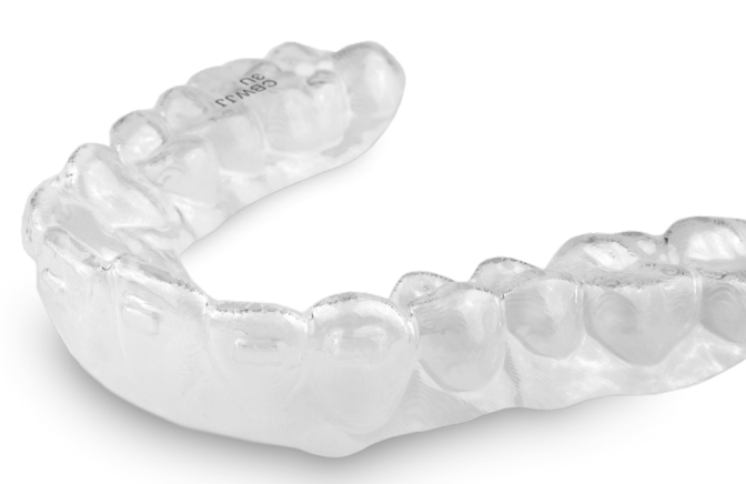
GO AHEAD. Show off those beautiful teeth.